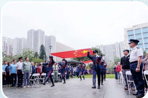
東區防火應急嘉年華 Eastern District Fire Safety & Emergency Preparedness Carnival