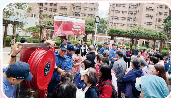
東區防火委員會火警演習及防火講座 Fire Drills and Fire Safety Talks organised by E.D.F.S.C.