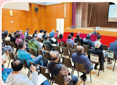
東區大廈管理座談會暨《2024年建築物管理(修訂)條例》簡介會 Eastern District Building Management Seminar and Briefing on Building Management (Amendment) Ordinance 2024